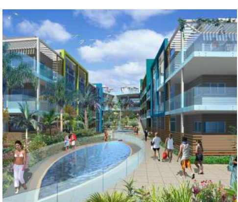
The development has a total floor area of 14 725m<sup>2</sup> and contains 32 residential units, 47 serviced apartments and 125m<sup>2</sup> commercial space.