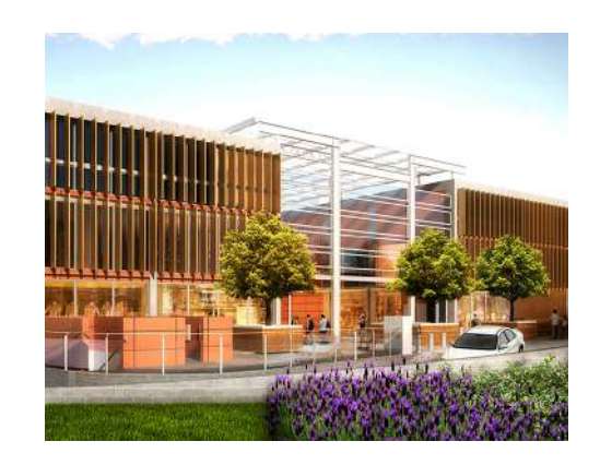
OLD NORTHERN RD, DURAL UNDER CONSTRUCTION

The mixed-use development in Gerringong consists of 10 apartments, 2 of them are 1 bedroom/adaptable, 2 are two bedroom and 6 are three bedroom. 279m<sup>2</sup> on the ground floor is dedicated for commercial use.