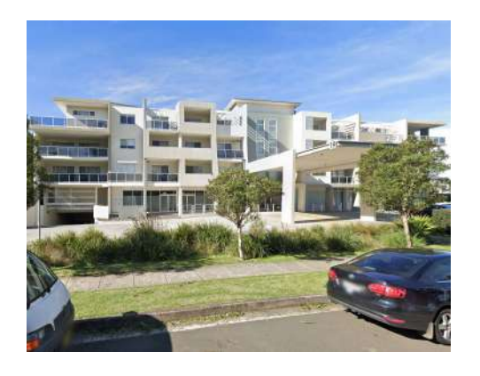
BOWEN STREET, HUSKISSON COMPLETED 2009