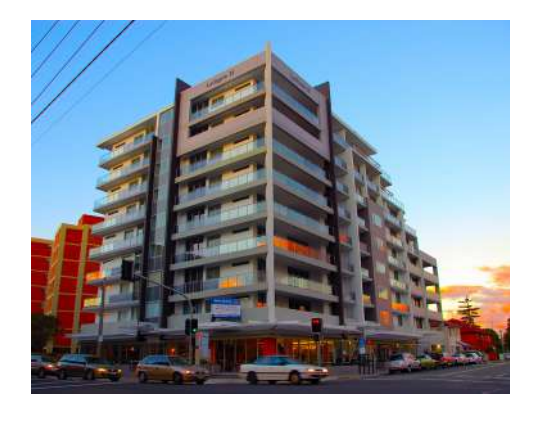
Known as Latitude 35, this apartment