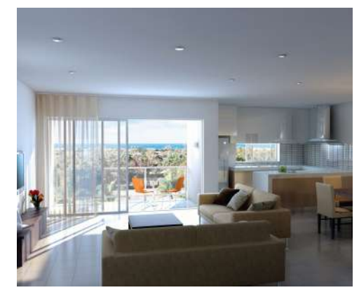
The 42 motel apartments in Pioneer Sands are complemented by resort style facilities including a sauna, gym, pool, etc. The 1-3 bedroom apartments have been designed to maximise natural daylight and space.