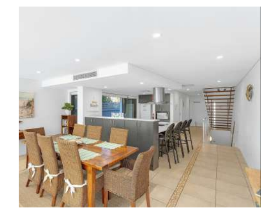
This development consists of 5 townhouses which enjoy views looking over Jervis Bay. The units are arranged over 3 levels with access to basement parking below.