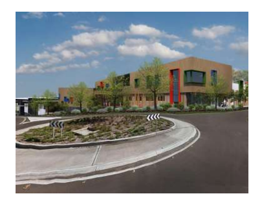
JERVIS ST, NOWRA COMPLETED 2005