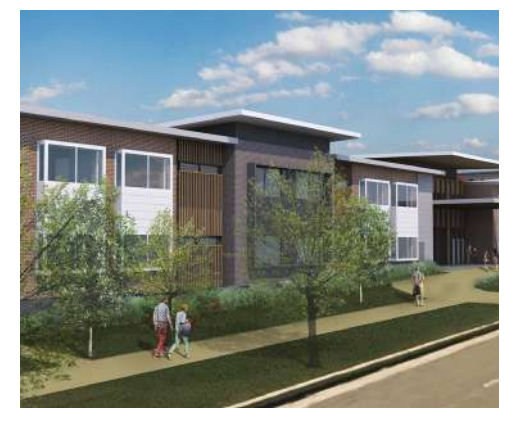
This project of 345 dwellings has a diversity of housing including 3 level apartments, terrace houses, aged care facility and a child care centre.