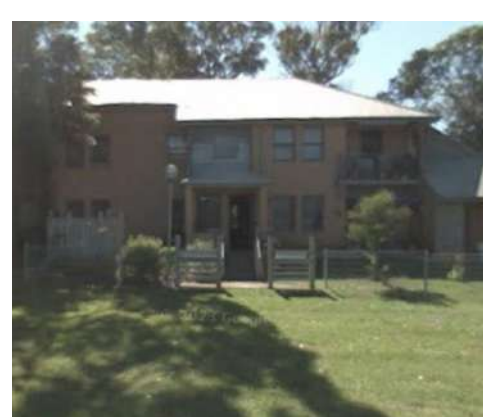
The project consists of 44 one + two bedroom apartments as social housing in Huskisson. The site arrangement is focused on semi private landscape zones with visitor parking only provided at the street frontage.