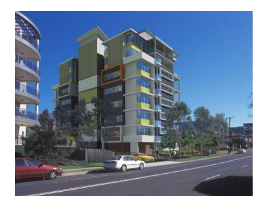
DAPTO ROAD, WOLLONGONG CONCEPT STAGE