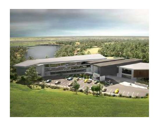
THE WATERS, NEWCASTLE COMPLETED 2015

With a total of 14 townhouses, all units are dual aspect to allow for cross ventilation and a diversity of balcony and courtyard living spaces.