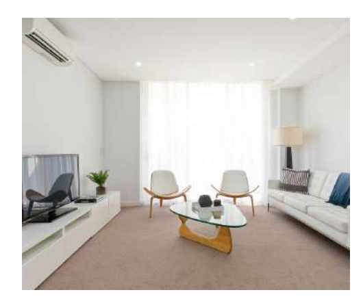
The Emerald consists of a 48 room motel, 40 residential apartments (ranging from 1-3 bedrooms) and 250m² for retail and community amenities. It is within close proximity to the town centre and 2.7km away from Strathfield Train Station.