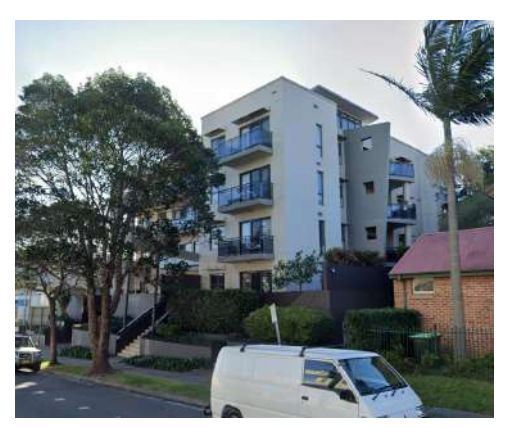
The building contains 16 units over basement parking with the layouts of the units maximising, where possible, views, solar access and privacy.