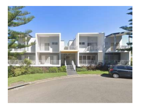
GLADESTONE AVE, CONISTON COMPLETED 2010