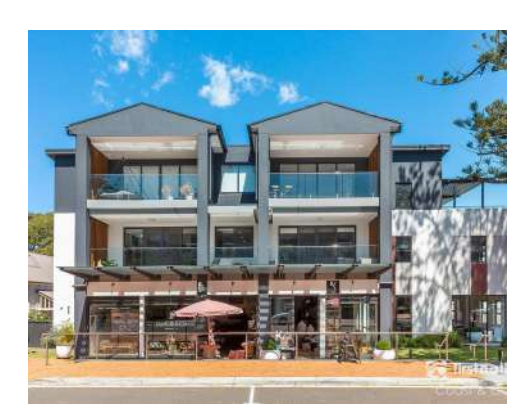
BELINDA ST, GERRINGONG COMPLETED 2023

Lighthouse development includes ground floor retail, first floor commercial uses, four residential podium levels and two towers each with nine residential levels, totalling 205 apartments.