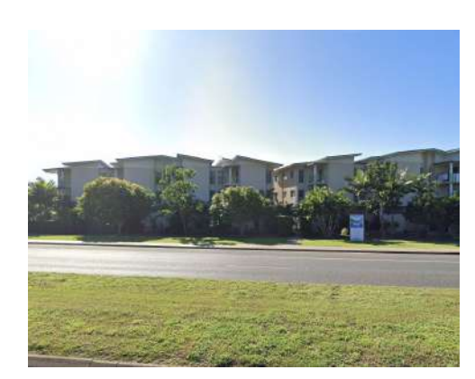
FARNBOROUGH RD, YEPPOON, QLD COMPLETED 2017

The development comprises of 53 units, 4 conference rooms a restaurant, pool, activities room and retail space. There is a mix of small, medium, large and penthouse accommodation which can cater to many budgets.