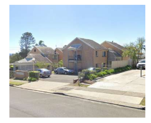
The project consists of 34 one + two bedroom apartments as social housing in Nowra. The site arrangement is focused on semi private landscape zones with visitor parking only provided at the street frontage.